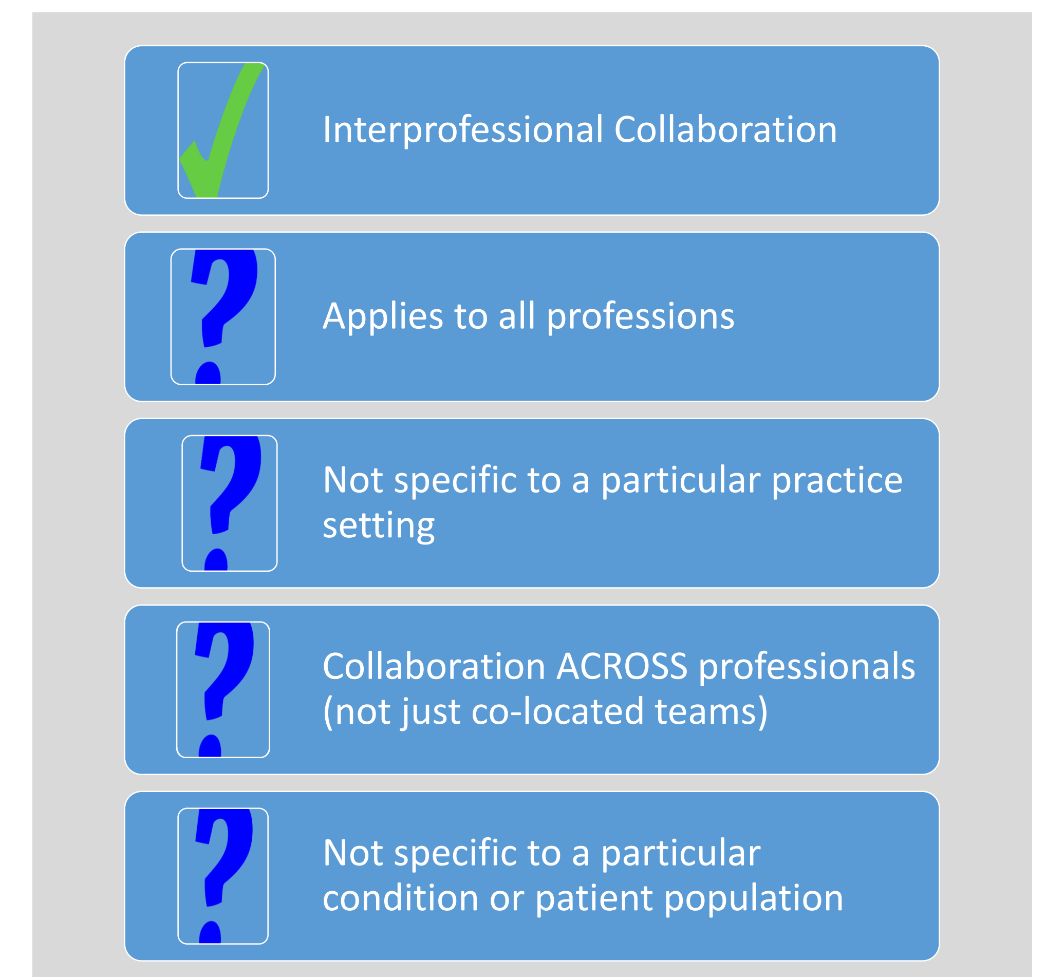
Figure 2. Criteria for Survey Suitability